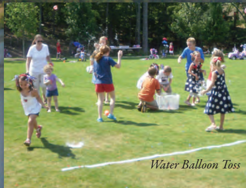
Water Balloon Toss