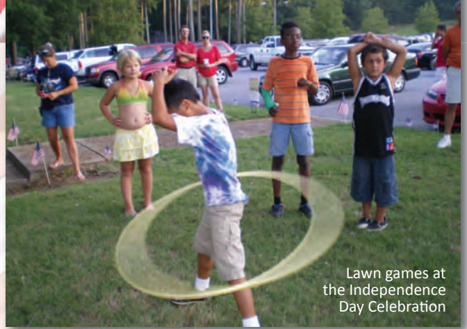
Lawn games at the Independence Day Celebration

8:45pm FAMILY MOVIE featuring Secretariat (PG) – Bring the kids, blankets, lawn chairs and a smile!