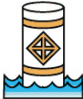
Answer on page 4

Non-lateral markers are navigation aids that give information other than the edges of safe water areas. The most common are regulatory markers which are white and use orange markings and black lettering as shown in this picture. These markers are found on lakes and rivers. What does this marker indicate?