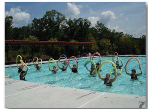
Photo to right: Water Aerobics Class held at Great Festival Park this Summer.

Cost is $32/individual and $50/couple for the month or $3 per class. Classes are now held at the Chapel. Please contact Loui at 770-345-2990 or fitness@lakearrowheadga.com for more information.