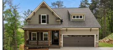
Laurel II | 4 Beds | 3 Bths | 2,463 SqFt 10 122 EAGLE HEART CT | LOT 308 Move-In Ready | $594,900