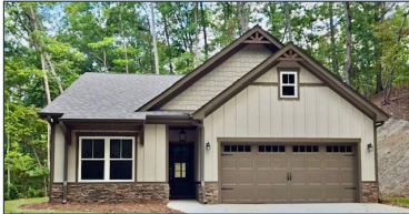
Juniper A | 3 Beds | 2 Bths | 1,551 SqFt 1 218 CHICKASAW DR | LOT 27 Move-In Ready | $449,900