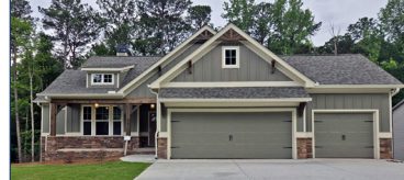
Reinhardt | 3 Beds | 2.5 Bths | 1,721 SqFt 7 117 FORT GIBSON CT | LOT 240 Move-In Ready | $564,900