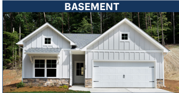
5 Juniper B | 3 Beds | 2 Bths | 1,695 SqFt 149 WHITE ANTELOPE ST | LOT 582 Move-In Ready | $484,900