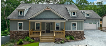
Etowah II | 3 Beds | 2 Bths | 1,770 SqFt 3 308 PINEBROOK DR | LOT 68-69 LAKE/CREEK VIEWS Move-In Ready | $474,900