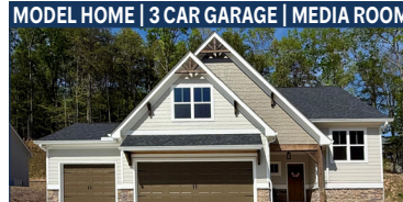
Spruce | 3 Beds | 2.5 Bths | 2,293 SqFt 9 114 FORT GIBSON CT | LOT 217 Move-In Ready | $584,900