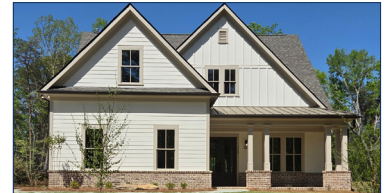
Gardner | 4 Beds | 3 Bths | 3,010 SqFt 13 172 CHEROKEE DR S | LOT 93 Move-In Ready | $754,900