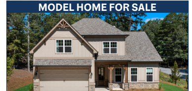
Chestnut A | 4 Beds | 3 Bths | 2,527 SqFt 12 102 FORT GIBSON CT | LOT 214 Move-In Ready | $739,900