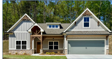
Hawthorne | 3 Beds | 3 Bths | 2,354 SqFt 8 122 FORT GIBSON CT | LOT 219 Move-In Ready | $575,900