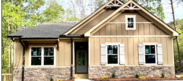
Juniper B | 3 Beds | 2 Bths | 1,695 SqFt 4 118 OSAGE CT | LOT 33 Move-In Ready | $479,900