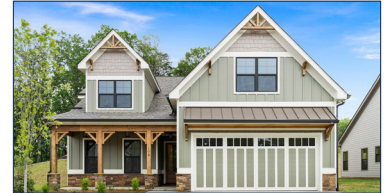
Red Bud B | 3 Beds | 3 Bths | 2,428 SqFt 11 108 CHEROKEE COVE | LOT 81 Move-In Ready | $644,900