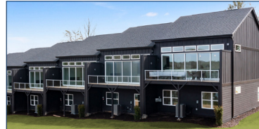
Newport | 3 Beds | 2.5 Bths | 1,717 SqFt 6 104 WATERVIEW CT | LOT 22 Move-In Ready | $542,900 112 WATERVIEW CT | LOT 24 Move-In Ready | $543,800 116 WATERVIEW CT | LOT 25 Move-In Ready | $539,900 120 WATERVIEW CT | LOT 26 Move-In Ready | $539,900 124 WATERVIEW CT | LOT 27 Move-In Ready | $576,800